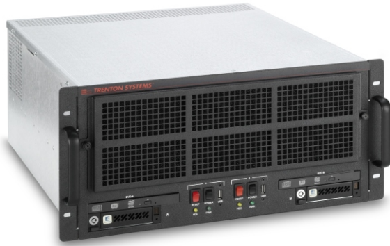
Trenton TRC5002 Rackmount System Shown with a two-segment backplane and two SBCs