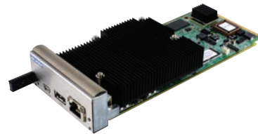
Figure 1: MIC-5602A2-M2E with Full-Size Front Panel