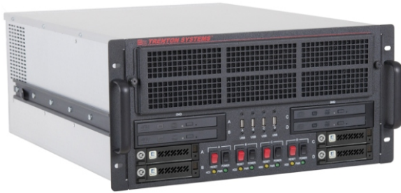
Trenton TRC5003 Rackmount System 1 Shown with a four-segment backplane and four SBCs