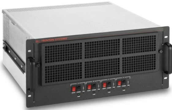
Trenton TRC5000 Rackmount System Shown with a four-segment backplane and four SBCs